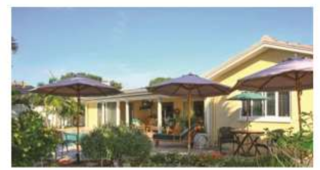
4429 39th Street South Recently Listed and Sold

Inventory is LOW and we have Buyers! Please contact us for all of your Real Estate needs. We are here to help you Buy, Sell or Relocate!