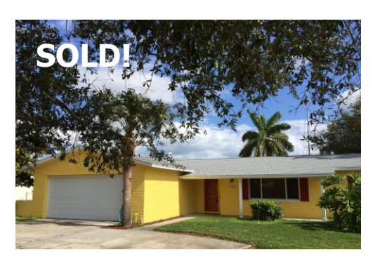
4460 38th Street S - Listed at $479,000 3 Bedrooms / 2 Baths - 2,136 sq ft Awesome kitchen. Mooring for up to 70' sailboats.