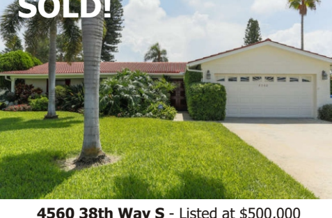
4560 38th Way S - Listed at $500,000 3 Bedrooms / 2 Baths - 1,772 sq ft Enclosed Florida room and covered lanai

OLLI is part of over 100 programs at colleges and universities around the country, providing classes and trips. Some people are members of both groups.